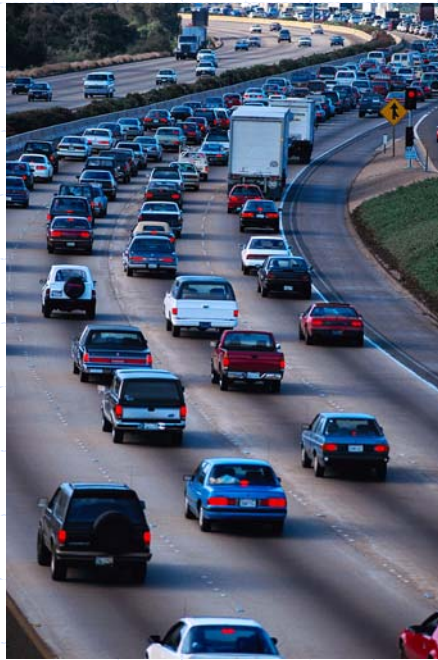
Percent of Jobs in Fairfax Held by Resident vs In-Commuters